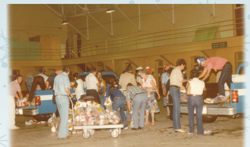
Prince of Whales Armory, 1984