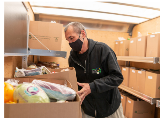
Edmonton's Food Bank staff and volunteer loading food hampers into the Mobile Depot for distribution